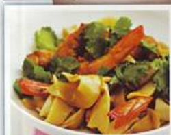
Teriyaki Prawn Noodles