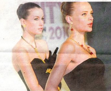
Cool in black: Models showcasing jewellery from Poh Kong during a fashion show.