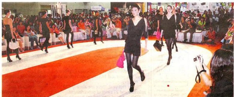
Bag it: Models showing Che Che New York handbags.