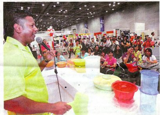
Green idea: Participants bidding at the Tupperware auction.