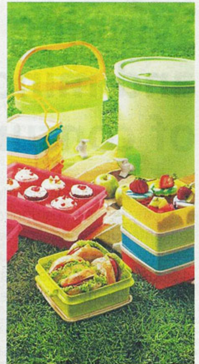
Tupperware is a brand icon which provides products that really work.

"We are constantly innovating and next year, we plan to launch four or five new products. We also aim to be the direct seller of choice and we are confident of our growth in the next year."